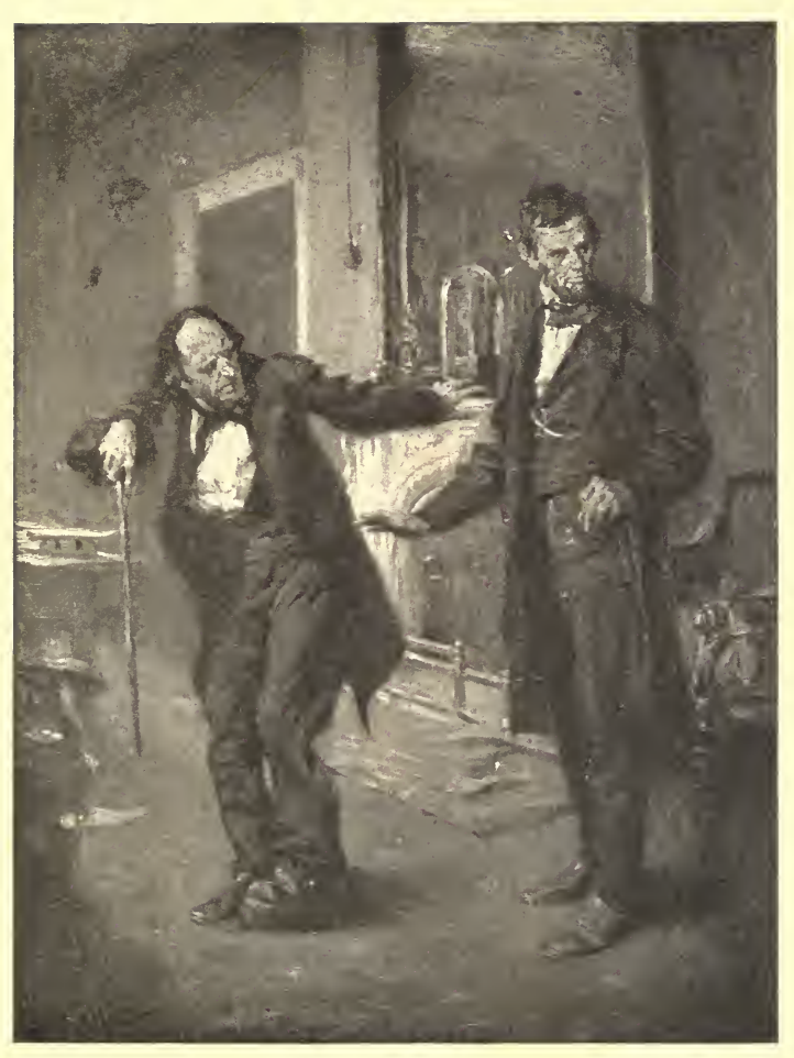
"The South is conquered soil. I mean to blot it from the map."